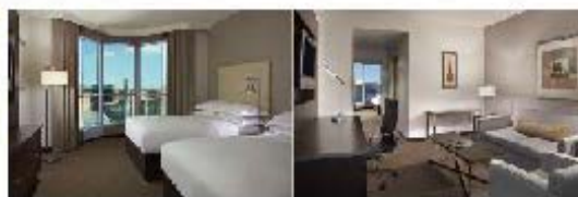
Standard Suite Double Bedroom and Living Room

8500 Warden Avenue Markham, ON L6G 1A5 905-470-8500 www.torontomarkham.hilton.com